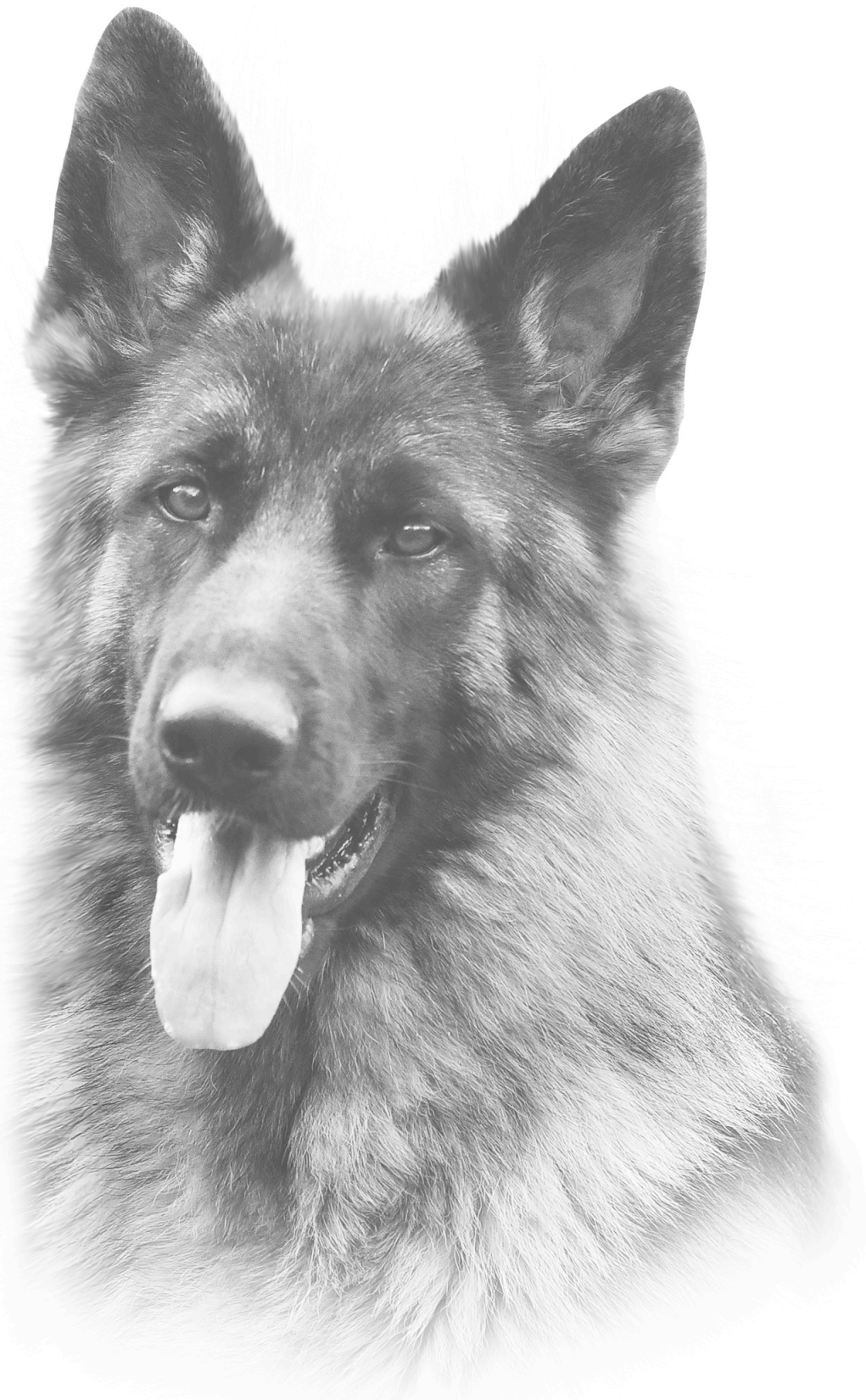
ACADIA VOM SEELENVOLL MOTHER OF THE LITTER